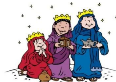
Children's Christmas Program