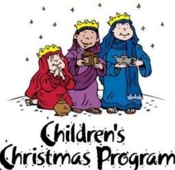
Children's Christmas Program